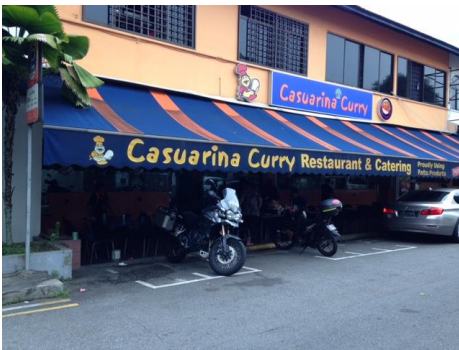
1. Meeting Point