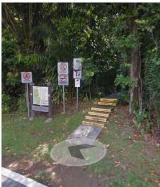
3. (Our Exit) Jacaranda Entrance point

For additional information on Lower Peirce, please refer to National Parks' website below >> nparks.gov.sg - Lower Peirce