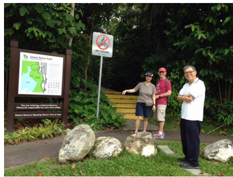
2. (Our Entry) Casuarina Entrance point